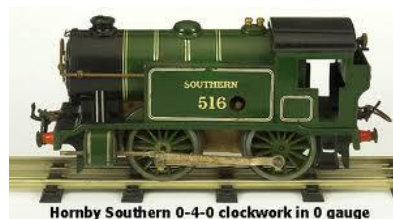
Hornby Southern 0-4-0 clockwork in 0 gauge

Entrance costs - £5:50 per adult, £2 per child (or a family ticket – 2 adults and 2 children £13)